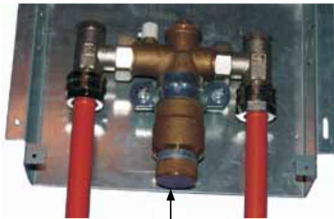
(°C) Water Temperature setting